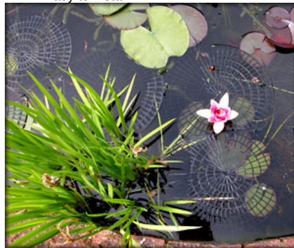
Rings can be cut for plants.